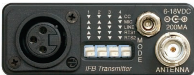
The rear panel provides the audio input and programming DIP switches for intercom and audio input type along with power and antenna input jacks.

256 UHF frequencies in 100kHz steps provide exceptional flexibility in coordinating frequencies in multi-channel wireless systems and avoiding interference from external RF signal sources and noise.